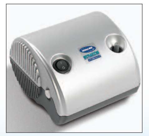
IRC1710 Stratos Compact Aerosol Compressor.

The new Reusable Jet Nebulizer is an extremely cost effective, durable nebulizer. The special geometry and smooth surface finish of the nebulizer result in minimal residual volume.